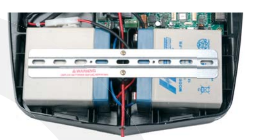
Integrated battery backup as standard