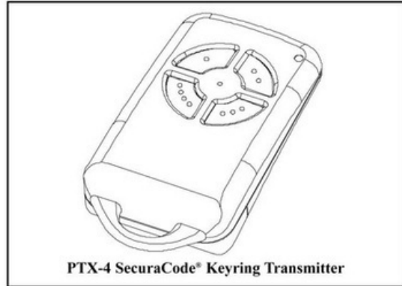
PTX-4 SecuraCode® Keyring Transmitter