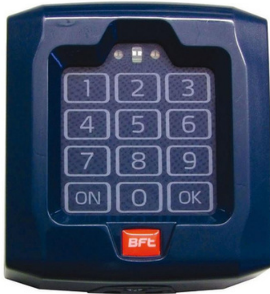
Genuine Q.Bo Wireless Keypad

10 Dallas Court Hallam, Victoria 3803 ABN 27 106 103 315 www.aggdoors.com.au enquiries@aggdoors.com.au (03) 8789 1385