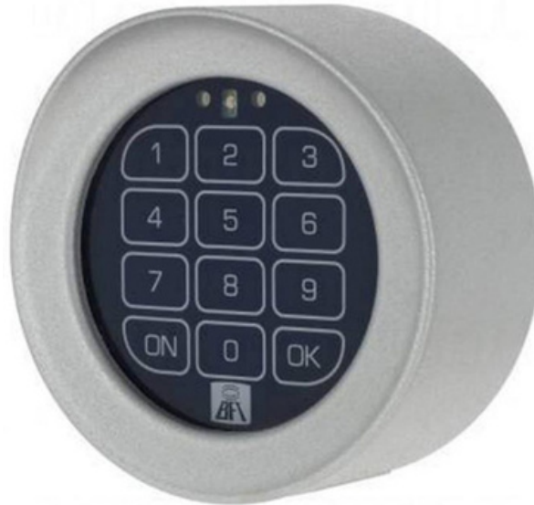
Genuine T-Box Wireless Keypad

10 Dallas Court Hallam, Victoria 3803 ABN 27 106 103 315 www.aggdoors.com.au enquiries@aggdoors.com.au (03) 8789 1385