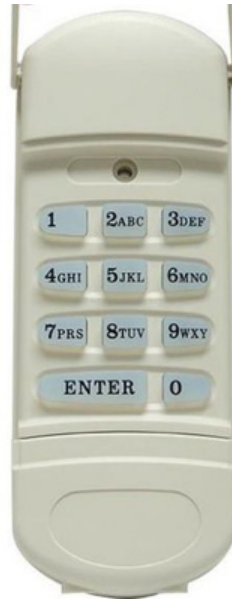
Genuine wireless keypad

10 Dallas Court Hallam, Victoria 3803 ABN 27 106 103 315 www.aggdoors.com.au enquiries@aggdoors.com.au (03) 8789 1385