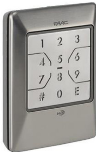
Genuine XKP W Wireless Keypad

10 Dallas Court Hallam, Victoria 3803 ABN 27 106 103 315 www.aggdoors.com.au enquiries@aggdoors.com.au (03) 8789 1385