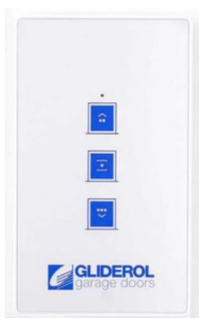
Genuine G+ 3 Button

10 Dallas Court Hallam, Victoria 3803 ABN 27 106 103 315 www.aggdoors.com.au enquiries@aggdoors.com.au (03) 8789 1385