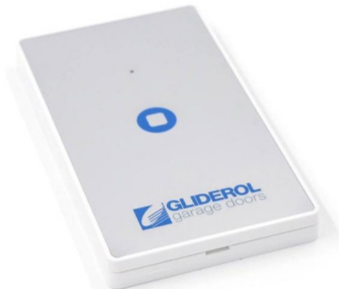
Genuine G+ Wall Button

10 Dallas Court Hallam, Victoria 3803 ABN 27 106 103 315 www.aggdoors.com.au enquiries@aggdoors.com.au (03) 8789 1385