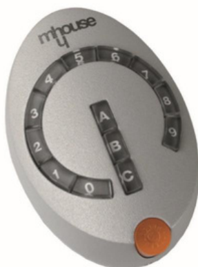
Genuine DS1 Wireless Keypad

10 Dallas Court Hallam, Victoria 3803 ABN 27 106 103 315 www.aggdoors.com.au enquiries@aggdoors.com.au (03) 8789 1385